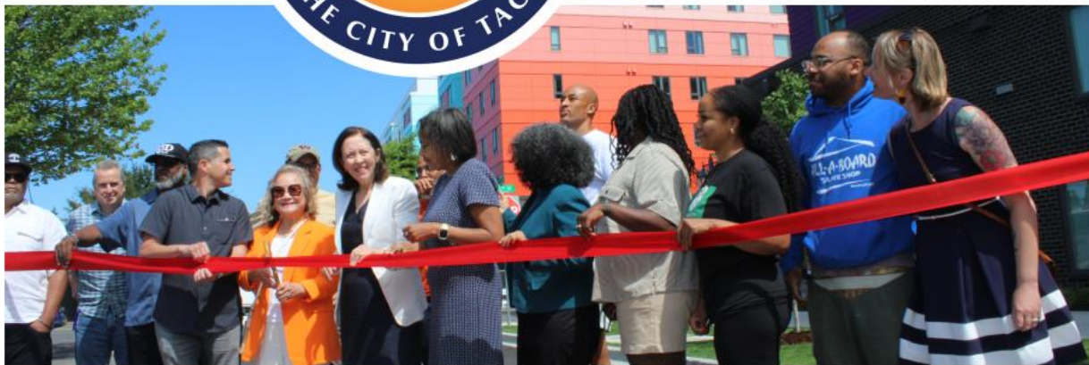
Draft Plan for Public Comment