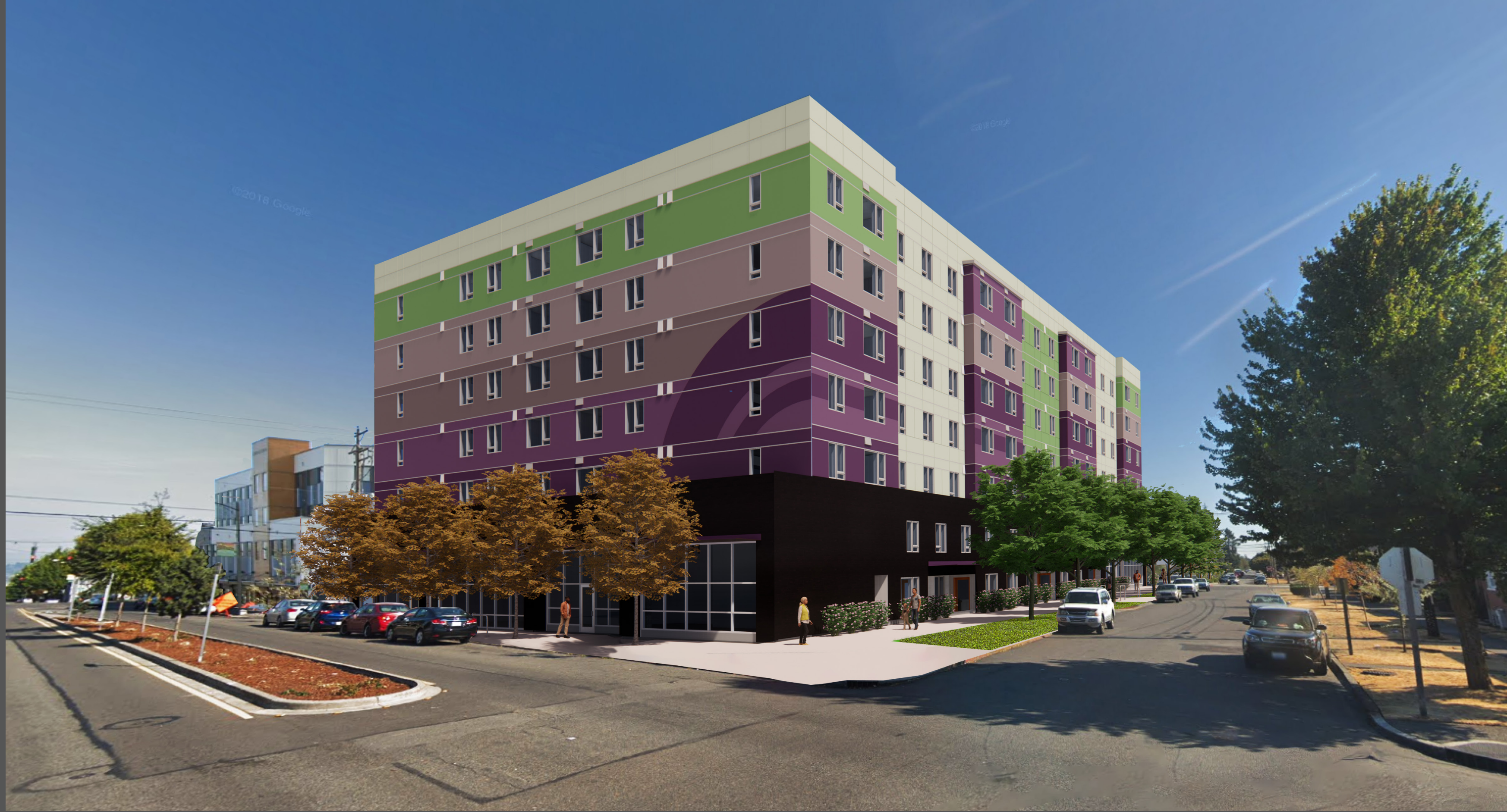
VIEW E: FROM S L STREET & S 11TH STREET LOOKING SOUTHEAST

I also wanted to reference the fact that one of my main goals was to add organic shapes to the building with so many hard lines. The ripple effect was perfect for this. I chose planters, bike racks, and even trash receptacles based on the concept.