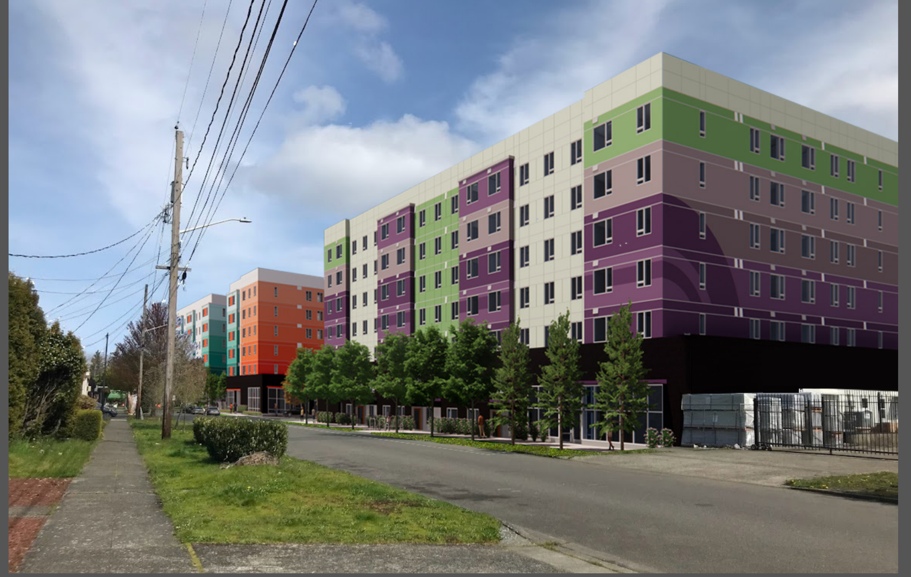
VIEW F: FROM S L STREET LOOKING NORTHEAST