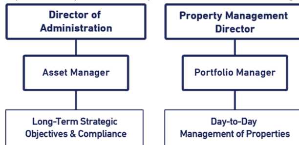
Figure 1: Organizational Structure

THA's Property Management Department is responsible for the day-to-day operations of THA's portfolio and the Administration Department is responsible for Asset Management and compliance. The chart below shows this relationship and the positions responsible for these management functions.